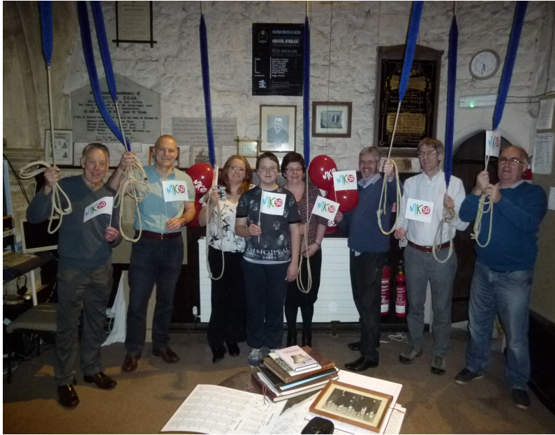
Ringers at St Mary's Bletchley

To kick off the celebrations the bells at St Mary's, Bletchley were rung on the 23 January from 16:45 to 17:30 by the local band (assisted by other members of the branch) immediately prior to the official launch of the MK50 celebrations at Bletchley Park (and hopefully within earshot).